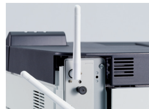
Print anywhere – the system is accessible from anywhere in the network, even by a smartphone or laptop.