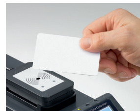
Print jobs can be released directly via network authentication with an ID card.